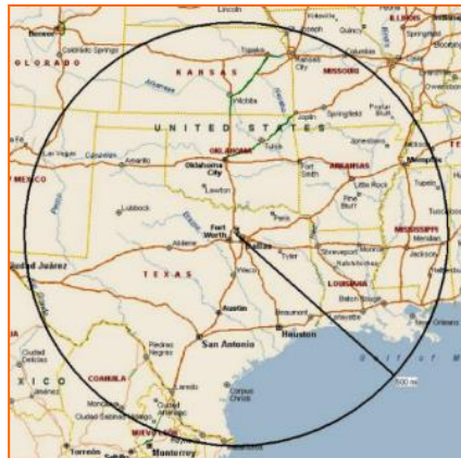
Fixed Wing Air Ambulance Service