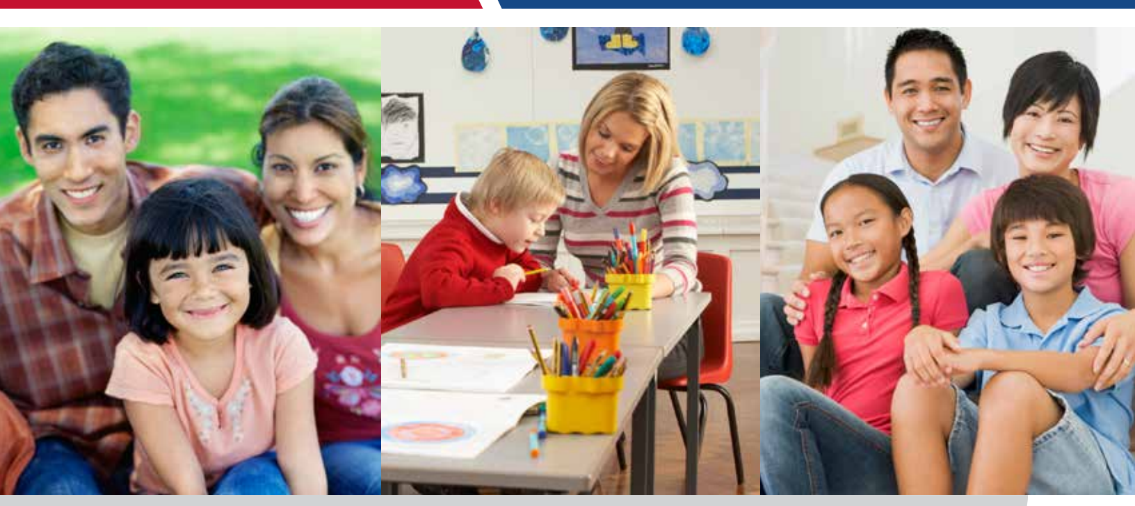
Easy Application Process · No Medical Exams · Excellent Customer Service · Learn More » »