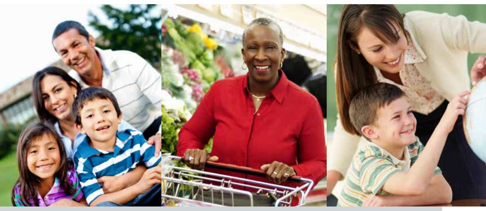
Coverage Options · Benefits Paid Directly to You · Excellent Customer Service · Learn More » »