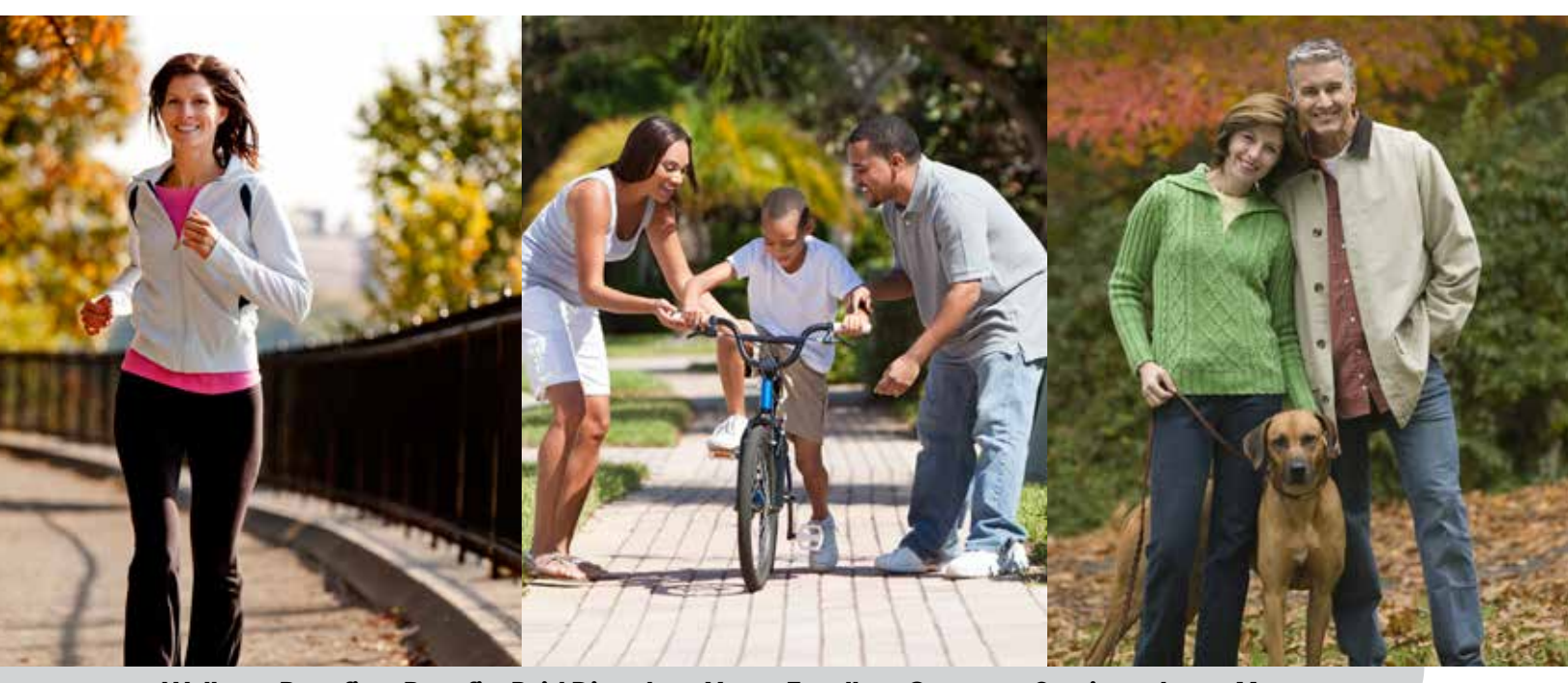
Wellness Benefit · Benefits Paid Directly to You · Excellent Customer Service · Learn More » »