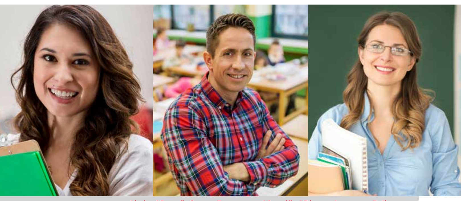
Limited Benefit Cancer Expense and Specified Disease Insurance Policy