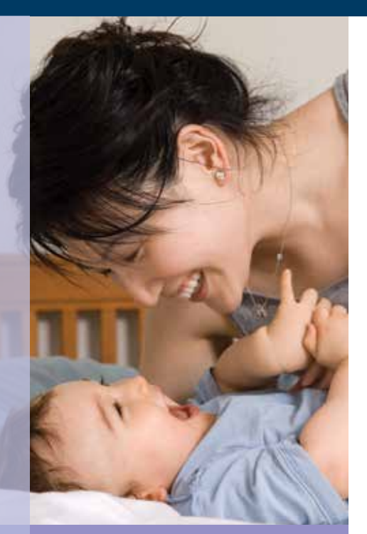
Let LifeTime Benefit Term be your Champion !