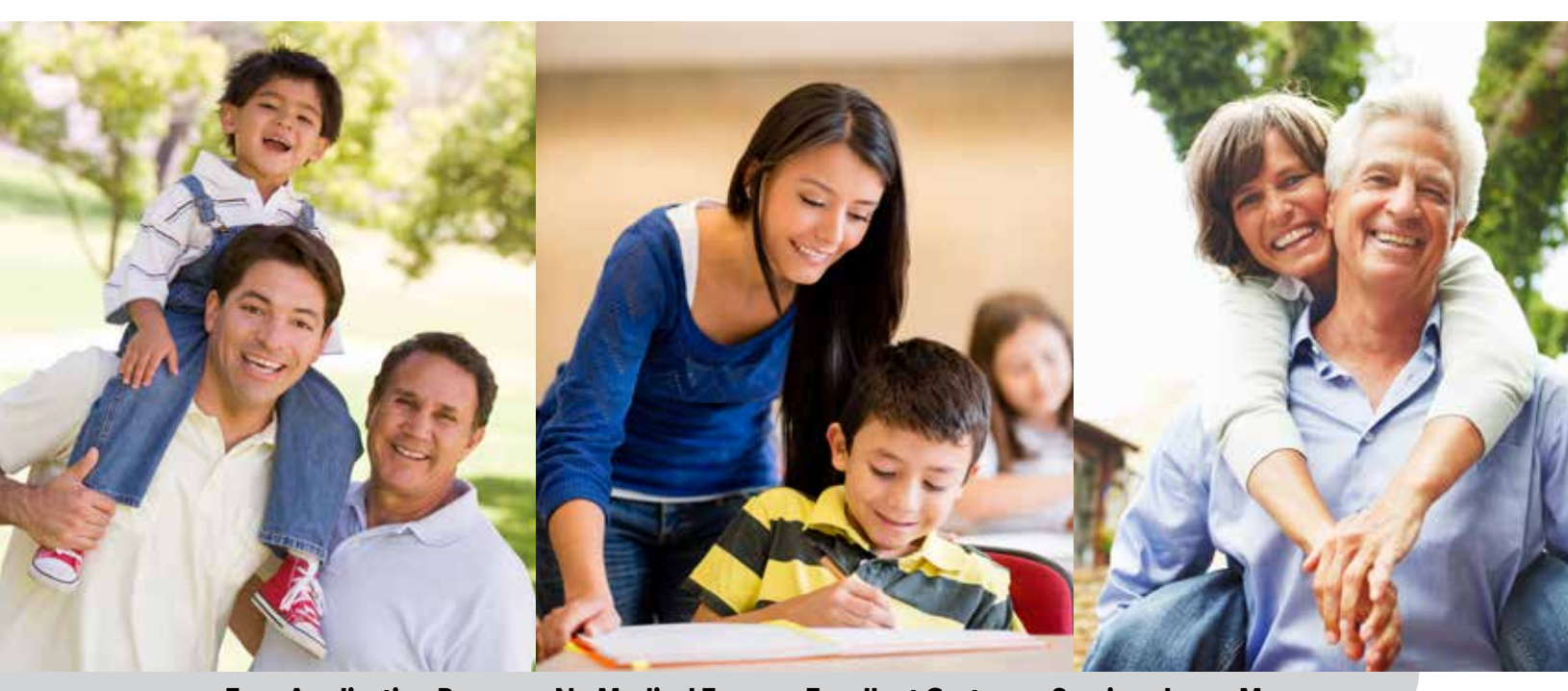
Easy Application Process · No Medical Exams · Excellent Customer Service · Learn More » »