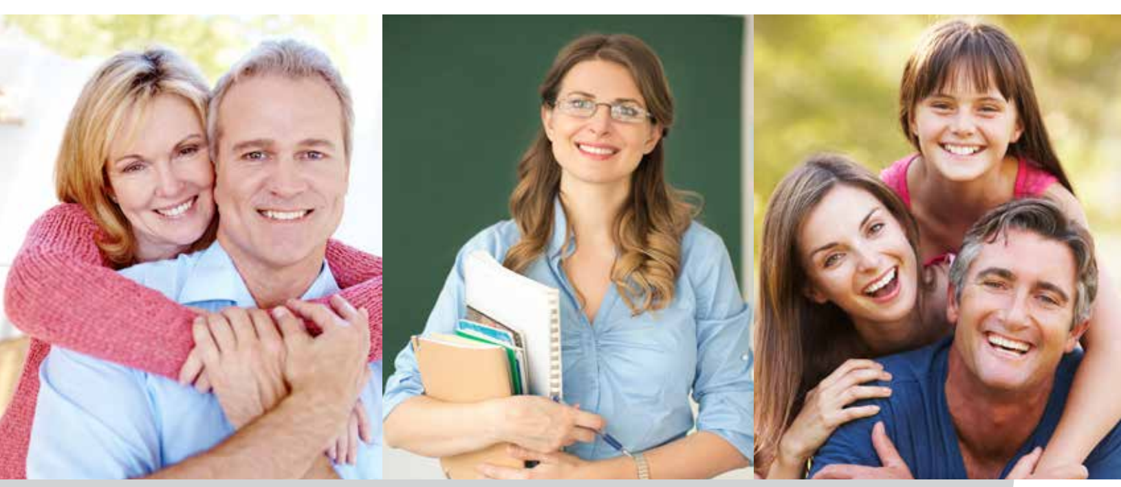
Easy Application Process · Flexibility · Excellent Customer Service · Learn More » »

Underwritten by: American Fidelity Assurance Company