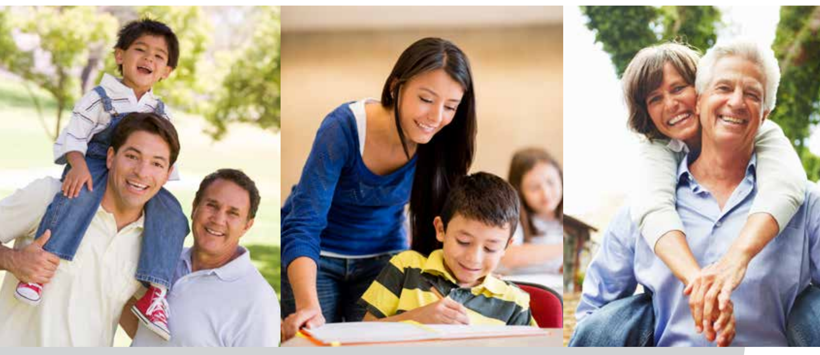
Easy Application Process · No Medical Exams · Excellent Customer Service · Learn More » »

10, 20 & 30 Year Renewable and Convertible Term Life Insurance